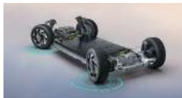
The world's only MPV with active rear-wheel steering as standard*