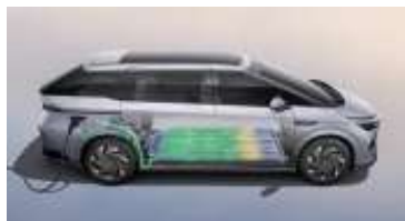
Full-range 800V high-voltage SiC silicon carbide platform