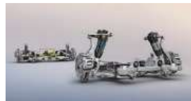
The only intelligent dual-chamber air suspension in China*